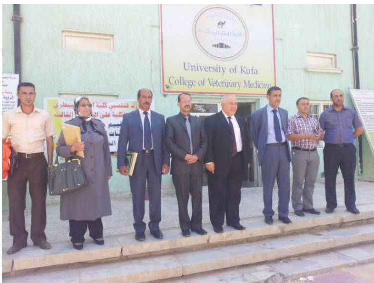
Figure.3. Show FVMUK’s academic staff and some other colleagues from college of veterinary medicine/ University of Baghdad during the one-day seminar about the application of drugs and its side-effects on public health

The FVMUK has a number of academic staff who teaches in different departments (Figure 3.) as well as a support staff and technician who assist in the teaching processes. The faculty is well equipped with modern equipment that is necessary for teaching processes as well as for research activities. The FVMUK has classrooms, laboratories, research facilities, offices and library. The faculty has established the research committee and animal ethical committee to ensure keeping the animal welfare issue and quality assurance.