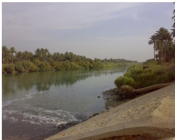
Figure1. Shows, the location of FVMUK in the heart of Kufa city near the Euphrates River

The FVMUK was established in 2008 and students, who enrolled in October 2008, are the first cohort to have successfully completed the five-year veterinary degree in July 04 2013. The Faculty established in Kufa city in Al-Najaf province (Figure1.). The faculty is located in the heart of Kufa city near the Euphrates River and close to the Faculty of dentistry. Kufa ( al-Kūfah, former Mesopotamian city) is one of most important Islamic cities in Iraq, about 170 kilometres (110 miles) south of Baghdad, and 10 kilometres (6.2 miles) northeast of Najaf. It is located on the banks of the Euphrates River. The estimated population in 2003 was 110,000. The city was the final capital of 'Imam Alī ibn Abī Ṭālib, and was founded within the first hundred years of the 622 Hijra. In this city, there is also the school where Jaber Iben Hayan studied. Westerners call him "the father of chemistry". Kufa was the city of the most beautiful Arab calligraphy, in which the Koran was written, as well as the broad outline of Arab grammar Abu El-Assouad Addaouali, whose grammatical school competed with the Basra school. The Najaf province and all its villages including kufa city is considered as one of the most important agriculture areas and livestock production, in addition to the Najaf desert, which contents a variety of natural resources and large number of camels that dominant there.